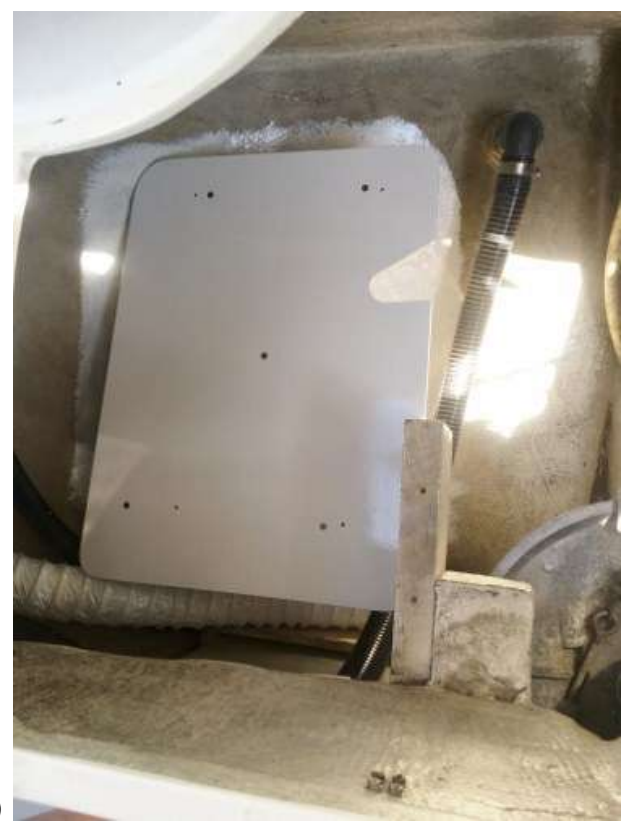
Photo (17) shows the new shelf the locker will sit on installed onto the support structure. The shelf is \frac{1}{2} " plywood primed and painted with Interlux Brightside primer and topcoat white paint. It is attached with #10-32 flat head SST machine screws with SST flat washers and SST nyloc nuts on the underside.