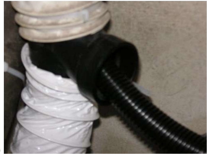
Photo (27) shows the hose supplying propane to the low pressure regulator on the externally mounted Magma grill protected by the .75" split loom entering the vent hose through a 3" x 3"x 2" sanitation tee. The tee is tie wrapped into the 3" vent hose that runs from the deck mounted cowl vent, through the aft lazarette, to the engine compartment.