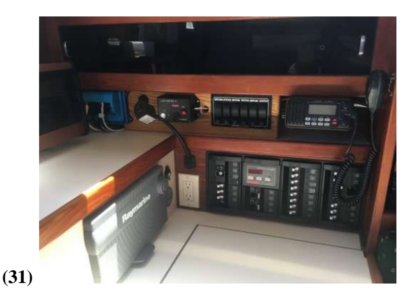
Photo (31) gives an orientation of where the switch panel is located relative to the Navigation Station desk.

The negative wire is labeled, and connects to the negative busbar behind the Main Distribution Panel. The positive wire is also labeled and runs from the solenoid in the propane locker to the fused switch labeled "Propane". See Photo (32). The solenoid uses a 5A AGC (glass) type fuse mounted in the front panel of the switch panel.