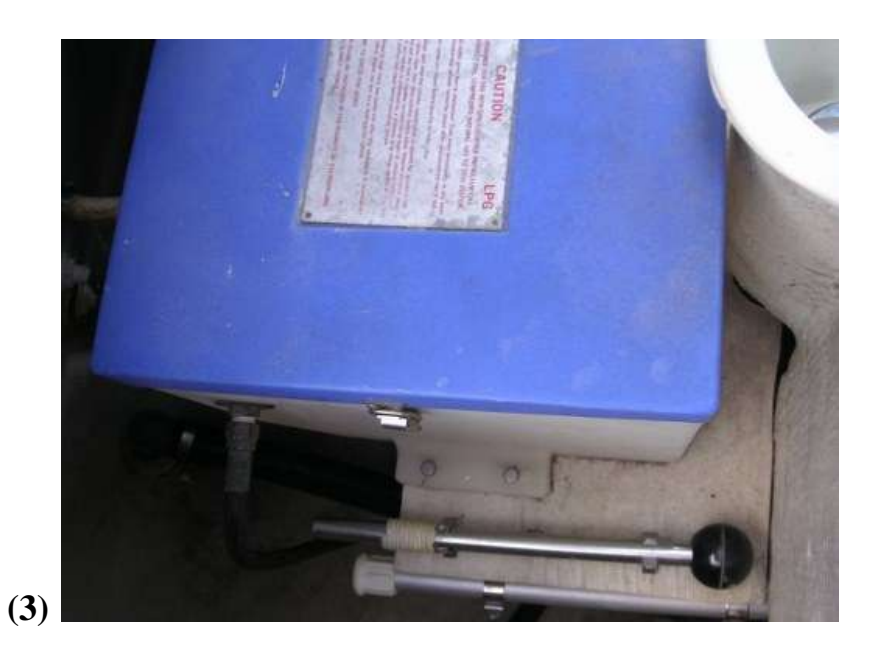
Photo (3) shows a crack in the mounting foot of the locker, and you can see one of the four SST latches used to clamp the top to the locker. Also shown are the Manual Bilge Pump and Emergency Rudder Handles mounted to the top of the wood radial cover. These will be relocated to the aft vertical 2 x 6 when the locker is relocated in the new design. Photo (4) shows the upper and lower 3/4" vent elbows and hoses.