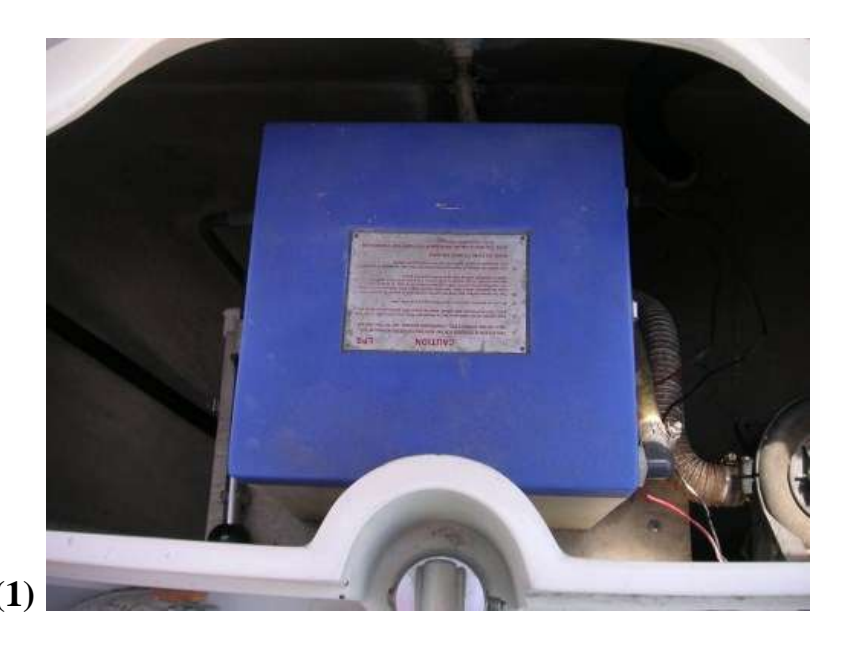
Photo (1) is the original propane locker mounted on the wood cover above the steering radial. It provides great access to the tank, gauge, and regulator. Being in the center of the lazarette opening blocks access for additional storage space. Photo (2) shows the externally threaded bulkhead fitting on the starboard side of the propane locker that the hose to the galley stove connects to.

The following photos show the boat before the propane system upgrade to help give you a perspective of my starting point. The text description for each group of photos is above them.