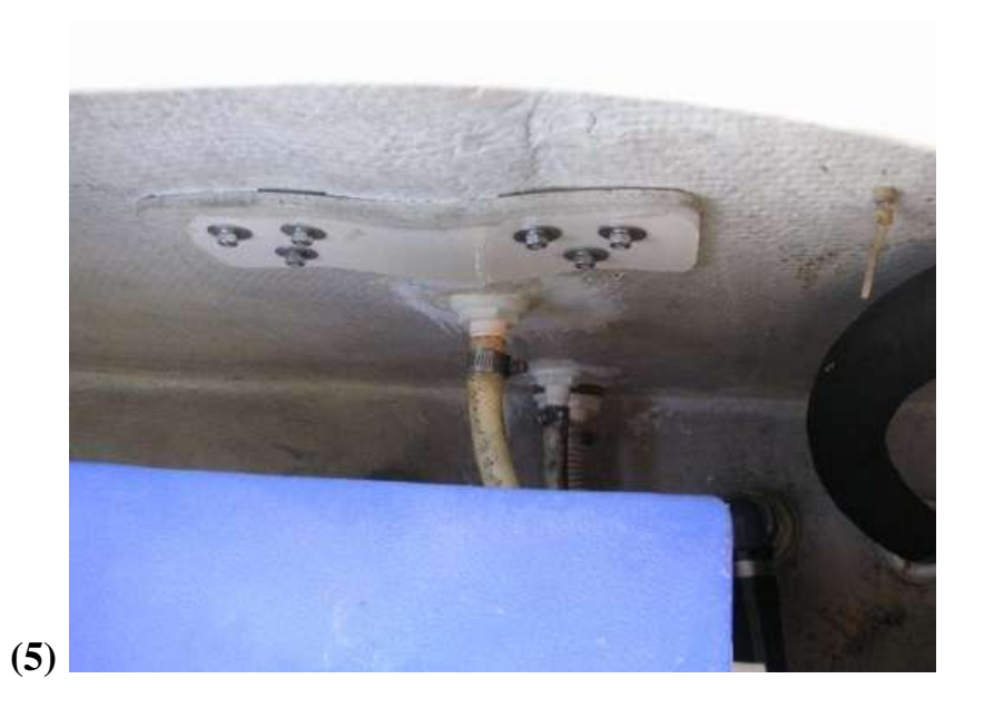
Photo (5) shows the vent hoses from the propane locker connecting to individual thru hulls in the transom. Photo (6) shows the solenoid wires exiting the locker through a hole drilled into a plastic fitting. Silicone was used to seal around the wires.