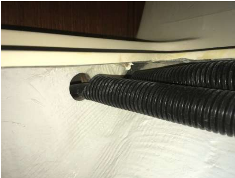
Photo (14) shows a close up of the bulkhead between the aft cabin and the galley. The propane hose exits the left split loom and passes thru a hole in the bulkhead to the back of the stove. The solar panel wires exit the right split loom and pass thru the gap between the hull and bulkhead. The wires continue between the liner behind the stove and the hull exiting past the refrigerator.