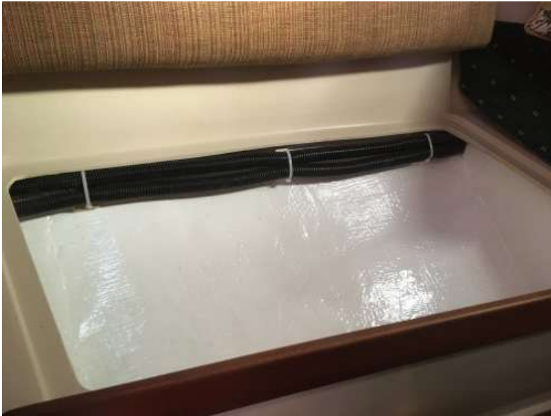
Photo (13) shows how the two split looms, one containing wires and one containing the propane hose, run and are secured along the inside top surface of the seat locker in the aft cabin.